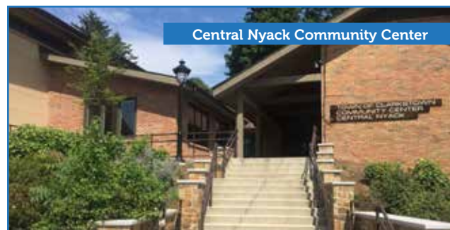
Central Nyack Community Center

Only service dogs are allowed in our parks and trailway.