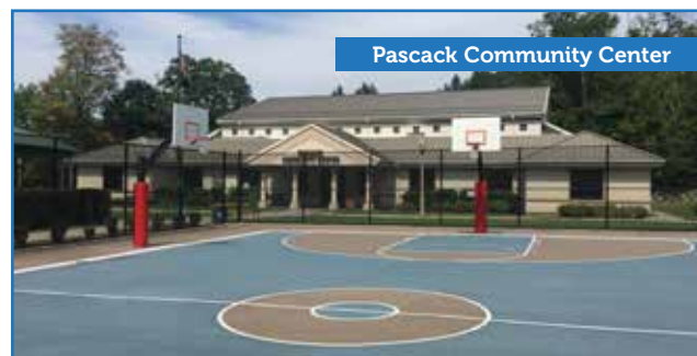
Pascack Community Center