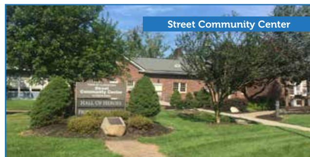
Street Community Center